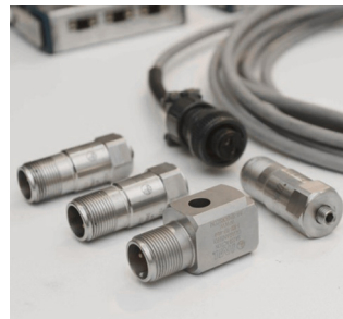
Sensors and wires used