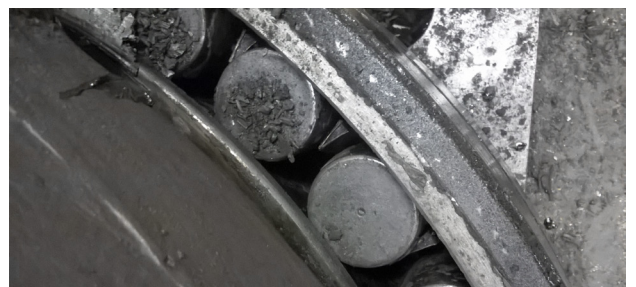
Slow-running bearing after long-term lubrication failure

Module Bearings is suitable for all spinning machines such as motors, fans, conveyors, gearboxes, and with the use of MUSA (Multi Sensor Algorithms) analyses also for presses and rolling machines of all types and sizes.