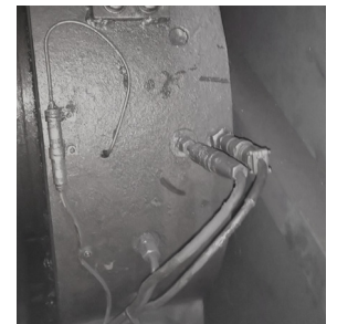
Sensors installed on the press